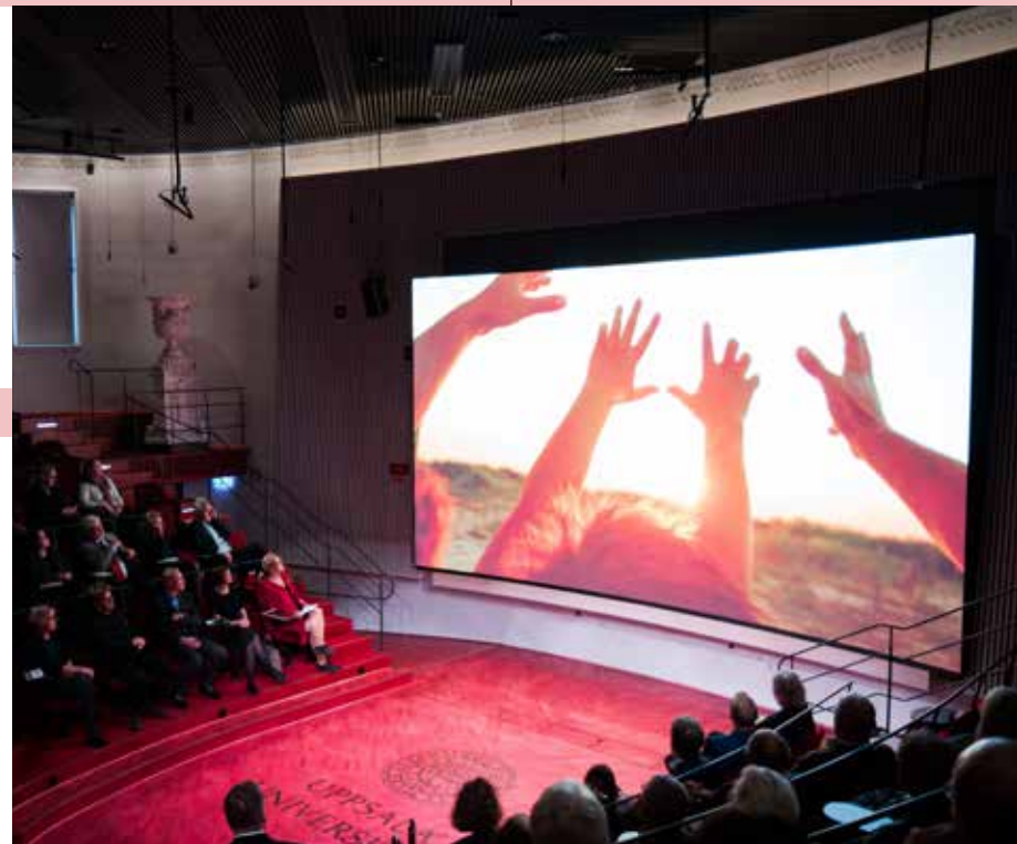
Interior view of the Humanities Theatre.